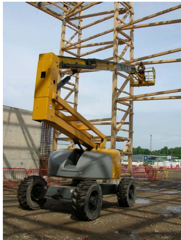
Figure 1 Operating a MEWP near overhead structures

focuses on minimising the overturning risks associated with mobile work equipment such as MEWPs. This is particularly relevant when considering the ground, environmental and operating conditions that the MEWP may experience.