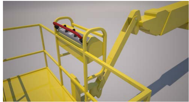
Figure 2 Examples of secondary guarding devices

For information about restraint systems used in arboriculture and forestry, refer to the HSE leaflet Mobile elevating work platforms (MEWPs) for tree work AFAG403 .